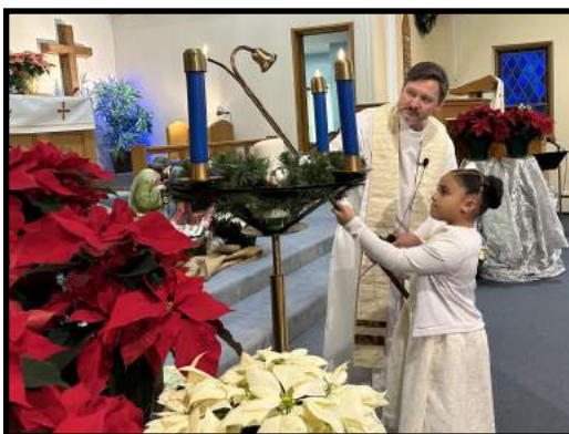
Our church was lovely for our Christmas Eve worship service. (R and above)