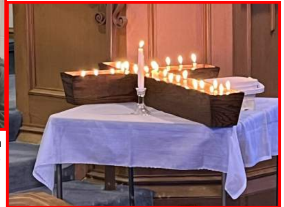
Lit candles were placed in the cross (below) on All Saints Sunday. Sam & Karlie look great dressed up for a wedding (bottom)