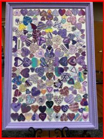
The hearts in this picture (L) were decorated by the folks living in the memory care unit at VMP as part of their Alzheimer's Assoc. fundraiser. The picture is about 3 ft tall.