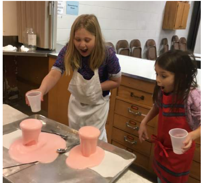
The Sunday School class did a science experiment blowing up the Red Sea and getting rid of Pharaoh and the Egyptian army.