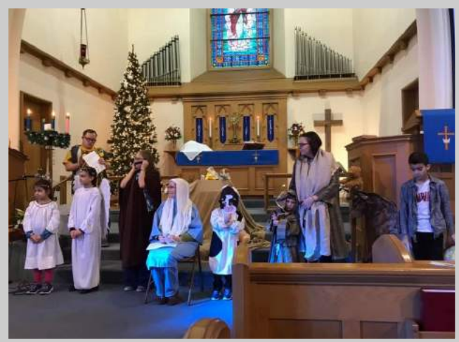
On Sun., Dec. 16, the Sunday School children presented their Christmas Program "The Stable Where Jesus Was Born".