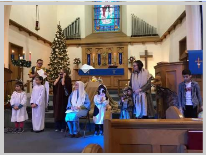
On Sun., Dec. 16, the Sunday School children presented their Christmas Program "The Stable Where Jesus Was Born".