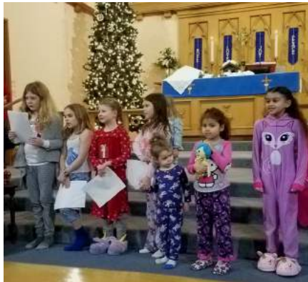
The Sunday School children presented “The Symbols of Christmas” on Dec. 17th and made Christmas decorations afterward.