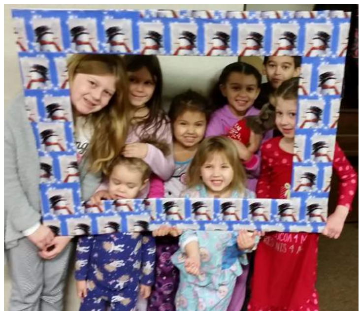
A SUNDAY SCHOOL SELFIE!