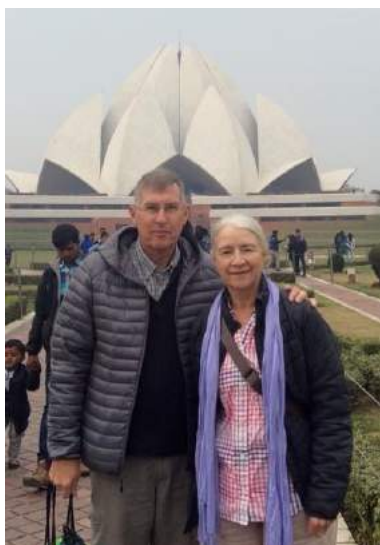
A Day in Delhi